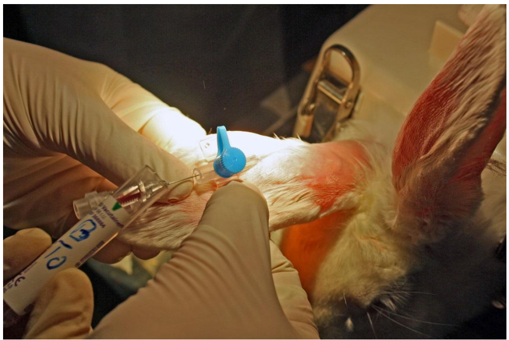
Figure 3. Blood sampling from central auricular artery using a vascular catheter

Alfaxalone is a synthetic neuron-active steroid. In this research we wanted to check for the first time if alfaxalone, as a steroid and a progesterone analog, can modify blood glucose levels. Glucose variation remained within normal limits with the highest value at minute 4, the minute with most pronounced cardio-respiratory depression. Amer et al. (1990) showed that on goats increased glucose levels results from administration of Saffan. Other studies showed an increased in plasmatic glucose after progesterone administration. Women using the progesterone-T intrauterine device showed blood glucose increased after three hours (Spellacy et al., 1978). A