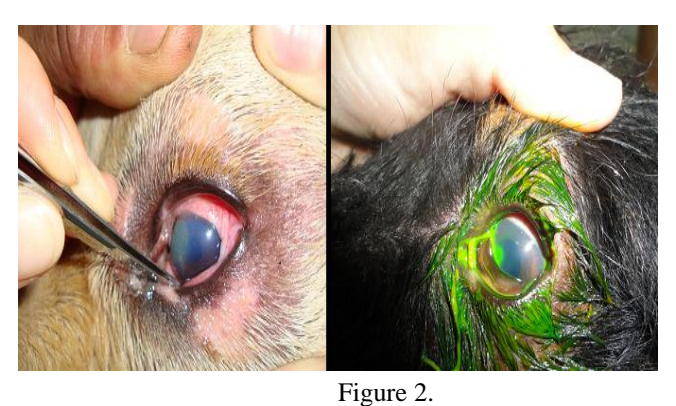
Left eye: examination of the internal face of the nictitant. Left eye: corneal superficial wound. Fluorescein test positive