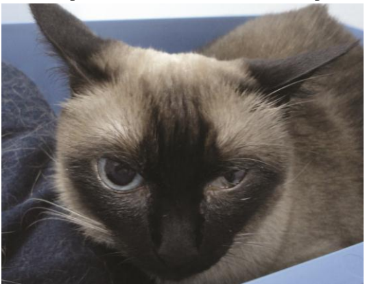
Figure 3. Left eye: Horner`s syndrome, secondary to chronic otitis. (note the enophtalmia, miosis, protrusion of the third eyelid and anisocoria)