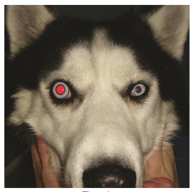
Figure 4. Left eye: Horner`s syndrome, secondarytosubclinical otitis, in a Husky, 11 years old (note the anisocoria, enophtamia)