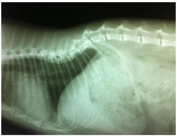
Fig.3 Lateral aspect plane x-ray of the cat with thoracic post-rickets skeletal abnormalities-lordosis.

After the patient is stabilized an exploratory abdominal surgery is put n place. One can easily no confirm all previous findings: urinary bladder injury, large hematoma caudal to the left kidney, enlarged left kidney and very small, hard to find right kidney (fig. 5/6.).