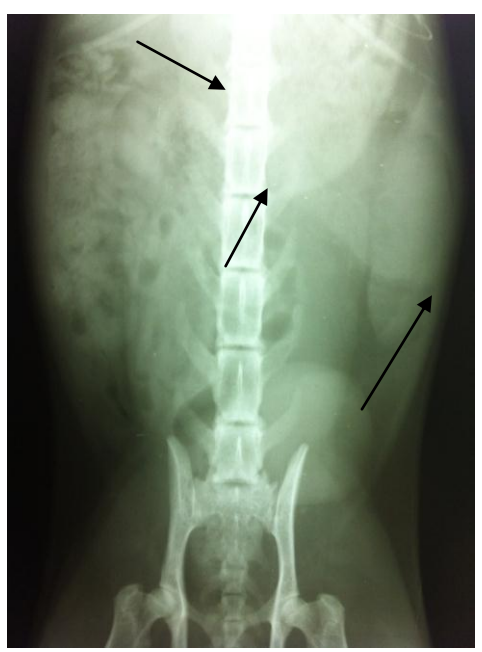
Fig.4 VD aspect, contrast x-ray. On the left, the two arrows point out the right hypoplasic kidney. On the right arrow point the left enlarged kidney with large caudal extracapsular hematoma. Urinary bladder filled with contrast.

After the patient is stabilized an exploratory abdominal surgery is put n place. One can easily no confirm all previous findings: urinary bladder injury, large hematoma caudal to the left kidney, enlarged left kidney and very small, hard to find right kidney (fig. 5/6.).