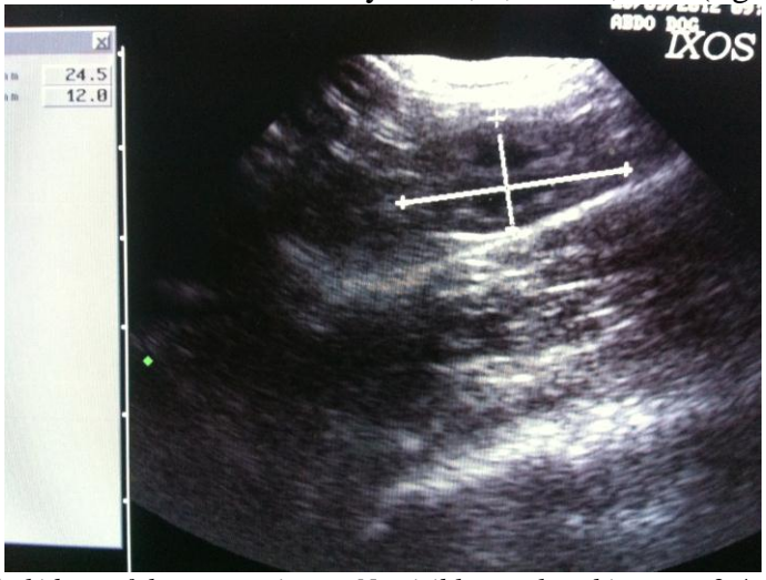
Fig.2 Right kidney of the traumatic cat. No visible renal architecture, 2,4 cm/1,2 cm.

There are no other findings worth mentioning until right kidney is reached for examination. It appears to be somehow hard to find. Right kidney has no visible normal architecture and is very small, 2,4 cm/1,2 cm (fig.2.).