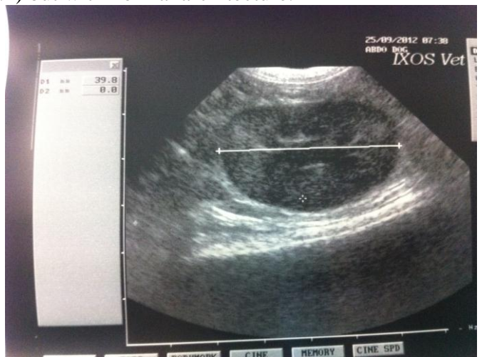
Fig.1 Left kidney of the traumatic cat. Long ax of 4 cm with normal architecture.

First abdominal scan reveals the reason for urinary blood-like color. One can detect a regular shaped urinary bladder that is filled with liquid and other floating structures which are considered to be blood clots. There is no integrity loss hint. Furthermore there is no free liquid inside the abdominal cavity or around the urinary bladder, nor into Douglas space. The left kidney becomes visible and is considered to be enlarged, with the longitudinal axis of 4 cm (fig.1) but with normal architecture.