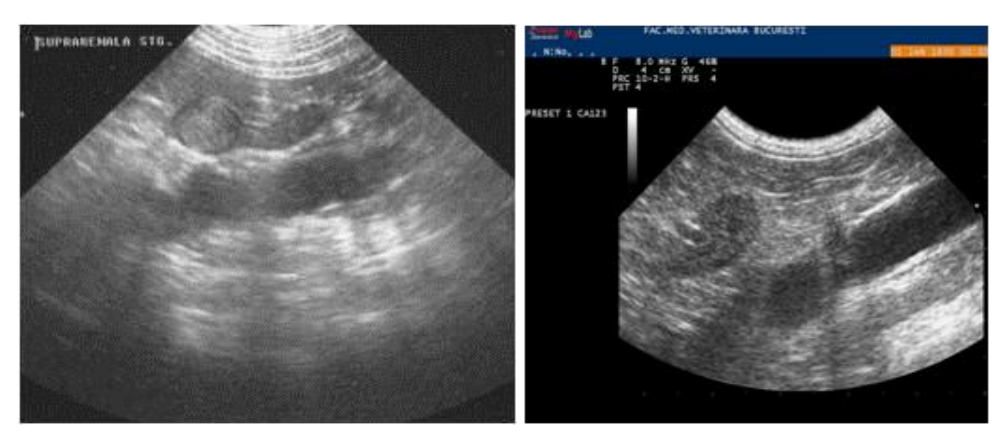
Figures 5 - 6. Nodular changes of different echostructure and echogenicity