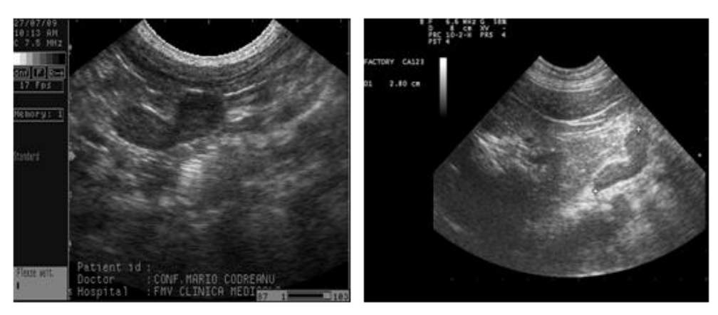
Figures 1 - 2. Diffuse adrenomegaly - normal echostructure

Ultrasound reveals in case of affected adrenal glands appears as distinct structures, flattened shape, appearance lobe, located cranio-medial kidney, caudal of the mesenteric and celiac artery and cranial of the renal artery and the right (lower) prior to renal vein and cranial right kidney (Figures 1-6). In Cushing syndrome the most important ultrasound changes were represented by diffuse bilateral in 68.75% (Figures 1-4), unilateral (18.75%) adrenomegaly and local ultrasonographic changes of irregular shape, different echostructure and echogenicity in 12.5%, of nodular aspect (Figures 5-6).