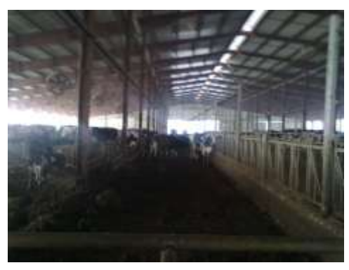
Figure 1. Different aspects from one of the studied houses for dairy cows Left: deep bedding area, Right: walking, feeding and manure collection area

For the second area of influence – social interactions – there were assessed 2 indicators: space allowance and herd structure.