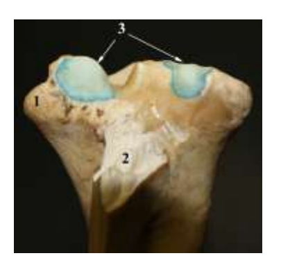
Fig. 4 Caudal face of the proximal extremity of cow radius (the left forelimb) 1-lateral tuberosity; 2-detachment place of the olecranon; 3- diartrodial surfaces for ulna