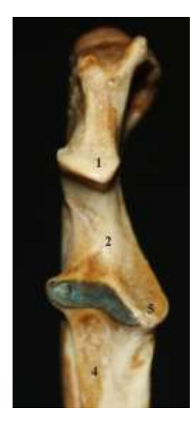
Fig. 8 Proximal end of dog's ulna (the left member, cranial view) 1 - olecranon beak; 2 - semilunar notch; 3 - radial notch, 4 - interosseous line; 5 medial coronoid process.