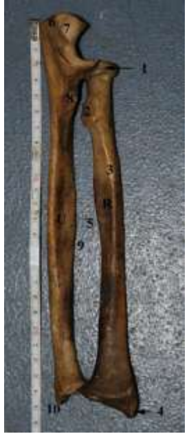
Fig. 9 Radius and ulna (human left member) R- radius; U-ulna; 1 - joint circumference; 2 - radial tuberosity; 3 – anterior edge; 4 - styloid process; 5 - interosseous edge; 6 - olecranon; 7- ulna trochlear notch; 8 - ulna tuberosity; 9 - ulna interosseous edge; 10 - styloid process.

Supination movement a of the thorax autopodium has the center in the forearm region, due to radius rotation around a longitudinal axis and at the same time, oblique to this mobile element, while the ulna remains fixed. The rotation axis passes through the center of the proximal radius extremity and its neck after leaving the bone, so that the distal part of the forearm can pass through the center of the ulna's distal extremity. As in humans, proximal radio-ulnar articulation of this group of animals has the structure of a trochoide joint or swivel joint. Radius joint circumference is maintained in contact with the radial ulna notch, due to annular ligament.