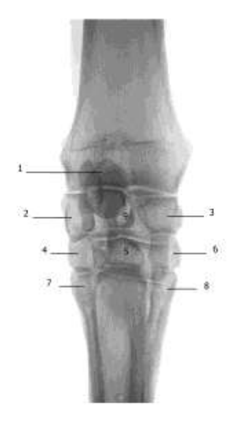
Fig. 2 The X – ray of carpal region, right member, dorsal aspect, pony 1 – the pisiform bone overlapped to lunate bone in X – ray image; 2 – pyramidal bone; 3 – lunate bone; 4 – unciform bone; 5 – capitat bone; 6 – trapezoid bone; 7 – proximal end of the rudimentary metacarpal IV; 8 – proximal end of the rudimentary metacarpal II.

Because of the flattening of the joint surfaces involved in the structure of medio - carpal and carpal - metacarpal joints, the joint capsules corresponding to these joints are less spacious in pony than the horse. This aspect is morphological reflected in the absence of the bottom side bag of the medio – carpal joint in the most cases in pony.