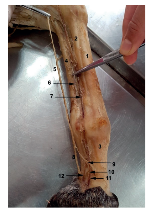
Fig. 2. Topography of vascular-nervous formations in the thoracic autopodium region in horses, left limb - medial view (original):

At the level of the proximal margin of the ungular cartilage the fascicle dissociates and only the artery and the proper digital nerve pass on its profound side to distribute to deep portions of the ungular region.