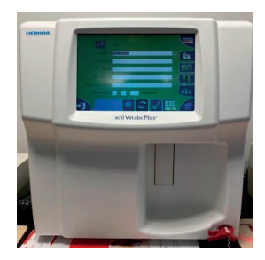
Figure 2. Hematology - Scil Vet Abc Plus

Imaging for the diagnosis of Polycystic kidney disease was established by using the Esaote Veterinary MyLab 60 ultrasonography (Figure 3).