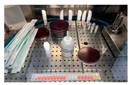
Figure 2. Api Staph kit (BioMerieux)

Staphylococcus spp. were then identified based on the colony characteristics, morphology, Gram stain, and colony pigmentation. Further, the identification procedure was continued by use of biochemical tests (API Staph, BioMerieux) (Figure 2).