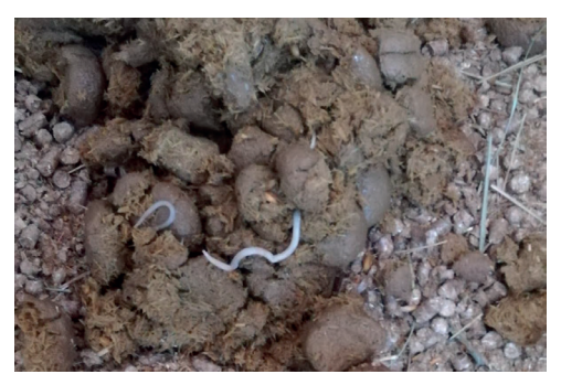
Figure 3. Adult Parascaris equorum worms shed after initial deworming

However, the prevalence of roundworm infestation remained close to the initial value, at 18.26% (21 positive horses), showing only a decrease in EPG values. The prevalence of E. leuckarti was 12.17% (Table 3).