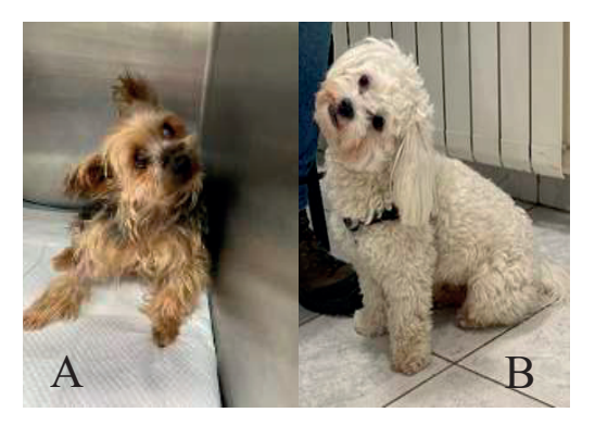
Figure 2. Dog with a right head tilt (A) and dog with a left head tilt (B)

Stages of the neurological evaluation included assessment of the mental status and behaviour, posture, cranial nerves, proprioception, gait and other abnormal movements, spinal reflexes, panniculus and perianal reflex (Dewey & da Costa, 2016). As a result, the lesion was localised within the central or peripheral vestibular system.