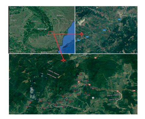
Figure 1: Map of the study sites in Sub Carpathian area, Romania.

The research has been carried out in 25 villages belonging to 8 administrative communes (Bisoca, Gura Teghii, Mânzălești, Lopătari, Bătrâni, Posești, Jitia and Vintileasca) located in the submontane area of the Curvature Carpathians, in the counties of Buzău, Prahova and Vrancea (Figure 1)