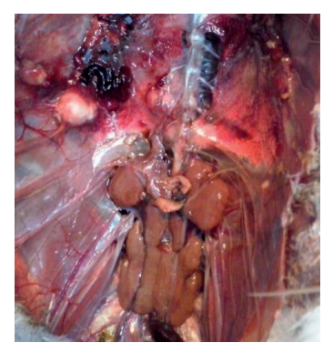
Figure 4. Carcass of a seagull (Larus argentatus) after removal of the digestive tract: lungs with granulomatous pneumonia and multifocal haemorrhages and kidneys with distrophic aspect

Lungs are examined at the carcass by visual inspection and then eviscerated following anatomic particularities, with blunt dissection (Rae, 2003; Samour, 2016). In the present study, 30 cases presented gross changes of the lungs. Most birds suffered of local and diffuse lung congestion. This is most likely the effect of respiratory stress in both chronic and acute cases of diseases that lead to the death of the birds. Other, less frequent lesions were lung anemia, necrosis and autolytic changes. Three cases of birds previously identified with granulomatous disease and fibrinous airsaculitis presented similar lesions on the lungs (Figure 4).