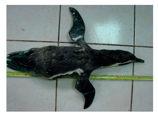
Figure 1. Measurement of body length-from the beak to the tail in the case of penguin

present study, the body weight was under the normal ranges regarding their species, showing poor husbandry conditions and predisposition to other pathologies further discovered during necropsic examination.