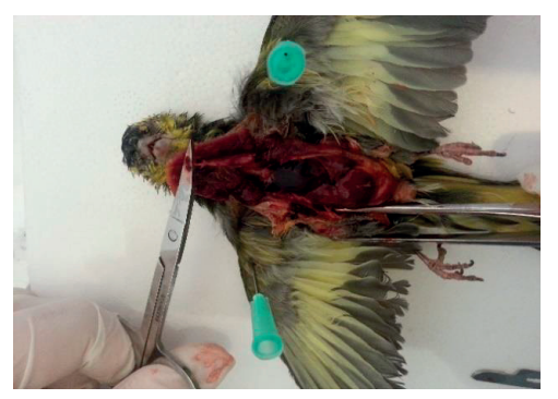
Figure 2. Ventral position of a canary (Serinus canaria) with pinned wings and internal examination of the carcass after sectioning the sternum: congestive organs and reddish liquid can be observed in the coelomic cavity

were nailed on a board in order to facilitate further examination as seen in Figure 2.