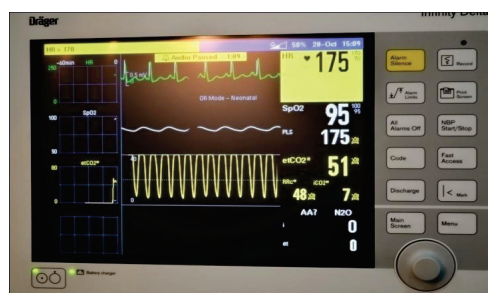
Figure 4. Monitoring for critically ill patients

Most common complication is hypothermia (79% of cases hypothermia versus 5% hyperthermia) and determines: