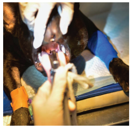
Figure 1. Endo-tracheal intubation for an emergency patient