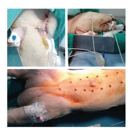
Figure 1. Vascular access: external jugular vein, auricular vein access, external saphenous access

Vascular access, at the level of the auricular vein or external saphenous vein, was possible for all the cases except 2 cases for which a jugular catheter was inserted (Figure 1).