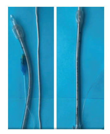
Figure 3. Rigid semiflexible intubating stilett, manually bent at one end

Some techniques are described for guiding the tube in the trachea: using a vascular catheter (Janiszewski, 2014), urinary catheter or a rigid stilett through the tube (Malavasi 2015). We used a rigid semiflexible intubating stilett (10Fr, \phi 3.3 mm), adapted manually to secure it in the endotracheal tube during intubation (Figure 3).