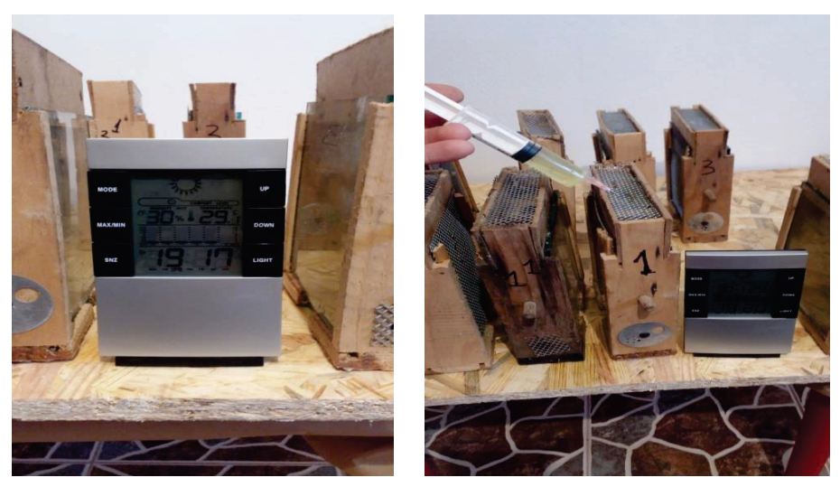
Fig. 1. Organizing the experiment: A. monitoring temperature and humidity in experimental conditions; B. administration of the test product (syrup)

of honey bees, mortality, and food consumption were performed; also, microclimate parameters (temperature, humidity) were monitorized (Figure 2).