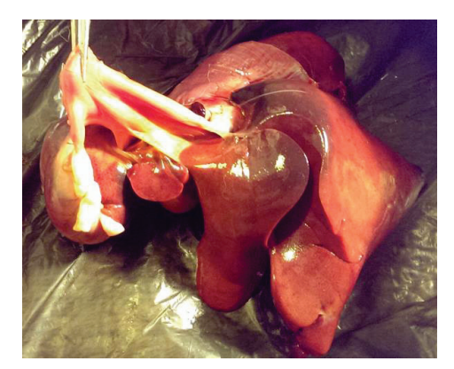
Fig. 3. - Part of right medial lobe liver spotted in pericardial cavity

pink color, suggesting an increased fibrosis consistency and presenting a visible stricture that demarcate the affected portion of adjacent liver tissue (Fig. 3).