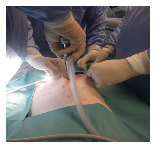
Figure 1. Abdominal insufflation with carbon dioxide

For the laparoscopic technique, abdominal insufflation of carbon dioxide is mandatory in order to allow proper visualization and manipulation of body tissues and instruments (Fig 1). Abdominal pressure of insufflated carbon dioxide was maintained at 6-8 mmHg.