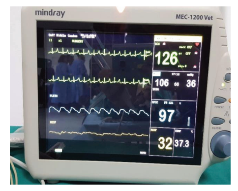
Figure 2. Vital signs monitor Mindray MEC-1200 VET<sup>®</sup>

Heart rate, respiratory rate, oscillometric blood pressure, rectal temperature and saturation of oxygen were monitored throughout the anaesthesia and recorded every 5 minutes using a vital signs monitor (Mindray MEC-1200 VET<sup>®</sup>). (Fig.2)