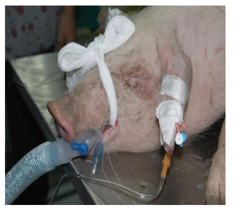
Figure 3. Orotracheal intubation

Mean values for oscillometric blood pressure, heart rate, respiratory rate, rectal temperature and saturation of oxygen are presented in table 1.