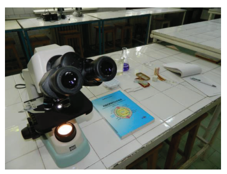
Fig. 3. The WBC count

The RBC (red blood cells) count was performed using an automated Coulter Counter, CP-diff analyser ACT 5 Beckman. The WBC (white blood cells) count was performed within the laboratory of the department of Physiopathology of the Faculty of Veterinary Medicine of Bucharest, using the Burker hemocytometer and the Natt-Herrick dilution solution (Figure 3).