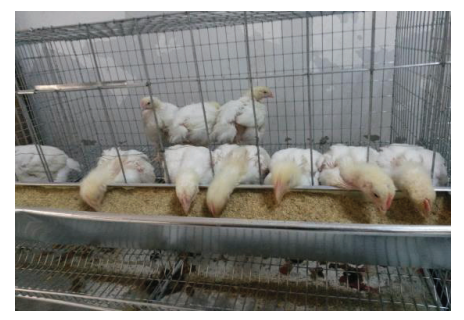
Fig. 1. Broiler batch study group

The experiment took place in the bio base of the Faculty of Veterinary Medicine of Bucharest and was conducted on two batches of broiler chickens of the Cobb 500 breed. Each lot contained 10 3-weeks-old individuals at the beginning of the experimental period (Figure 1).