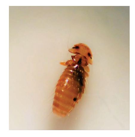
Fig. 3. Menachantus spp. dorsal view (stereomicroscop)