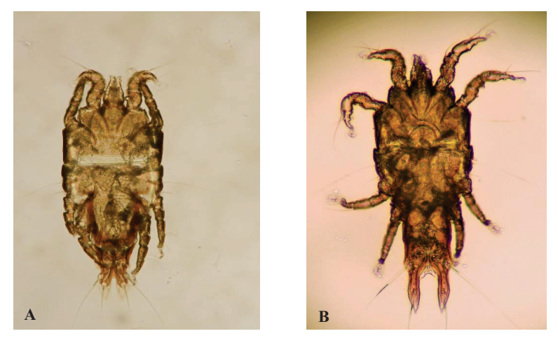
Fig. 1. Trouessartia spp.: A) dorsal view of male; B) dorsal view of female