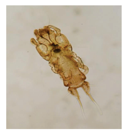
Fig. 2. Proctophillodes spp. ventral view (10X)