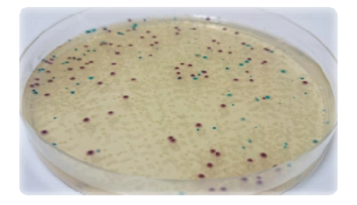
Fig. 3. Specific S. aureus colonies (cream) on Chromatic detection agar (original)

Figure 3 presents S. aureus aspects of colonies in the Chromatic detection agar, according to the technical specifications given by the manufacturer. These colonies are cream colored.