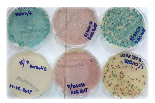
Fig. 2. Aspects of colonies in the Chromatic detection medium (original)

After reading and interpretation of specific colonies on plates with Chromatic detection agar, seeded faecal samples from dogs were isolated microorganism with pathogenic potential for humans (Fig. 2). From 60 faecal samples, 18 samples were positive for Staphylococcus aureus (18/60; 30%). The results of the special chromogenic agar plating are shown in Table 3 and Fig. 2.