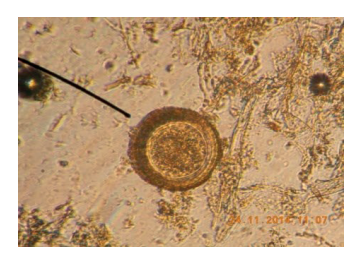
Figure 1. Parascaris equorum egg identified by flotation method in horse feces (200x)

The samples cross-examined using the McMaster method showed an infestation of under 500 EPG for Strongylidae eggs and under 100 EPG for Parascaris equorum eggs. Patient history and clinical examination didn't reveal any clinical manifestation of helminthosis in any of the horses.