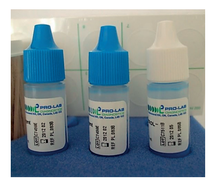
Figure 1. PROLEX STAPH LATEX KIT

The clumping factor was revealed by a rapid kit PROLEX STAPH LATEX KIT, produced by PRO-LAB DIAGNOSTICS (Figure 1).