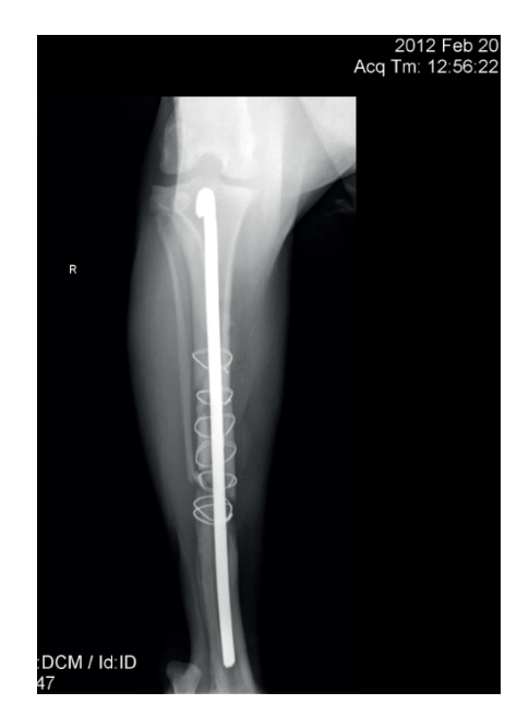
Figure 4- Postoperatory x-ray, cranio-caudal exposure

Channel dimensions brooch is being withdrawed at the same time with compact bone reconstruction and the introduction of final brooch. The anatomical plans of the soft tissues are being restored and finally the postoperatively radiological control is repeated to assess the outcome of the surgery.