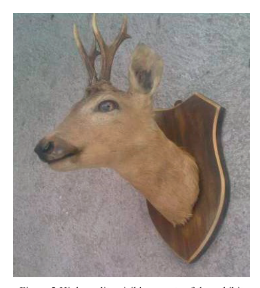
Figure 2 High quality visible aspects of the exhibit

The use of Eulan® SPA 01 in taxidermy proved to be very efficient in our study, because it keeps away the insects. Due to this aspect, it increases the storage rate of the exhibit and last but not least, its economic and cultural value (Fig.2).