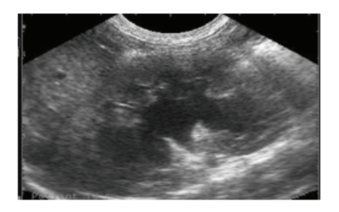
Figure 3. ureterohydronephrosis third degree

- ureterohydronephrosis of first degree (Fig. 1), in 5 out of 40 dogs (12.5%), by dilatation of basinet, ureter and calices. Caliceal structure was appreciated as normal.