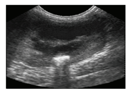
Figure 2. ureterohydronephrosis second degree