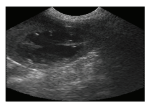
Figure 1. ureterohydronephrosis first degree

- ureterohydronephrosis of fifth degree (Fig. 5) in 2 out of 40 dogs (5%), with extreme dilatation of urinary ways and lack of renal parenchyma.